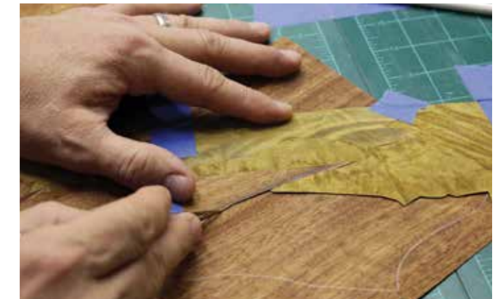
7 Placing the grass veneer over the bank veneer, still using the window method