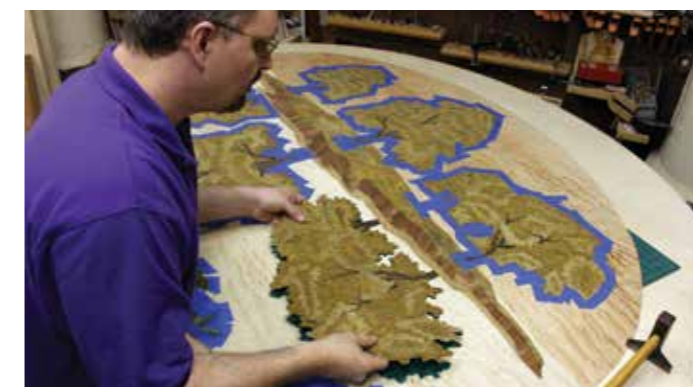
18 After the waste veneer is removed, tape on each insert until the completed marquetry section of the top is complete

For the outside border, use a walnut burl. To cut out the veneer I make a cutting clamping caul out of 25mm thick plywood. The caul is the same radius as the marquetry edge and hangs over the outside edge of the top by 6mm. I use this border caul to cut out the walnut burl using the caul as a guide on top of a cutting mat and using a scalpel. After you're finished cutting out the veneer, use the caul to glue and clamp down the veneer to the border around the top, gluing on one piece at a time. Let the glue dry for about three hours before moving on to the next corner.