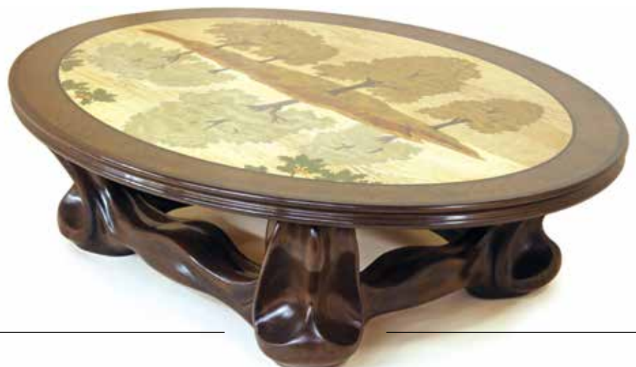
30 The completed Art Nouveau coffee table base