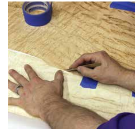
4 Here I'm cutting and fitting together the sky and the water veneer