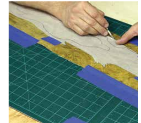
5 Cutting out the grass section of the tracing paper