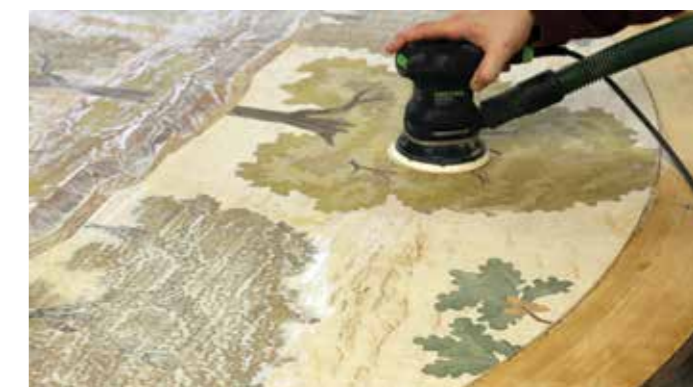
19 To remove all the paper and water gum tape, I use a Festool ETS 125 EQ random orbital finish sander with 150 grit abrasive