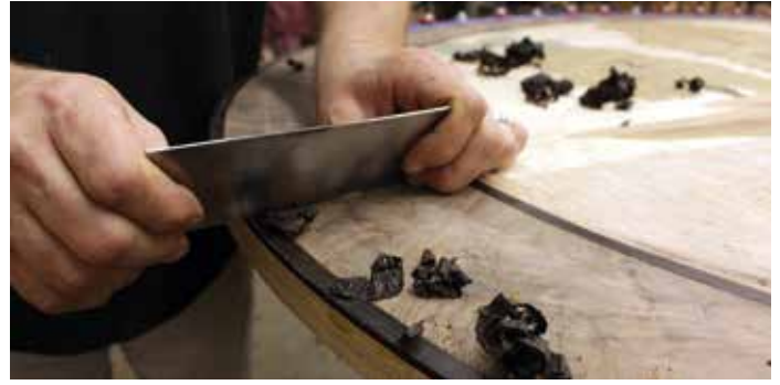
23 Using a hand-held cabinet scraper to shave off the excess ebony to where it is flush to the veneer