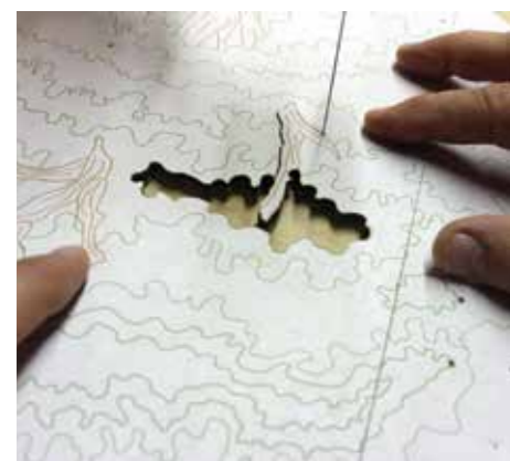
15 It's best to cut out the centre pieces first and work your way towards the outer pieces

the two plywood cauls with a weight on top and set aside while you complete the rest of the eight packets. Once you have all the packets complete, place them on the background veneer and hold in place with tape. This way you can take a step back and look at the overall top to make sure all trees and leaves are in their proper place before starting the next step.