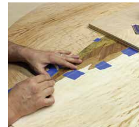
9 Using painter's tape is an ideal method for keeping all of the pieces together