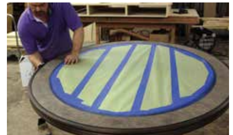
27 Using a walnut colour aniline dye, which penetrates deep into the pores