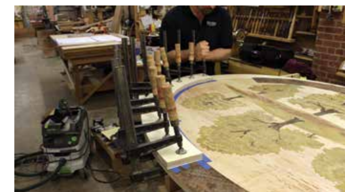
21 Using the caul to glue and clamp down the veneer to the border around the top, one piece at a time