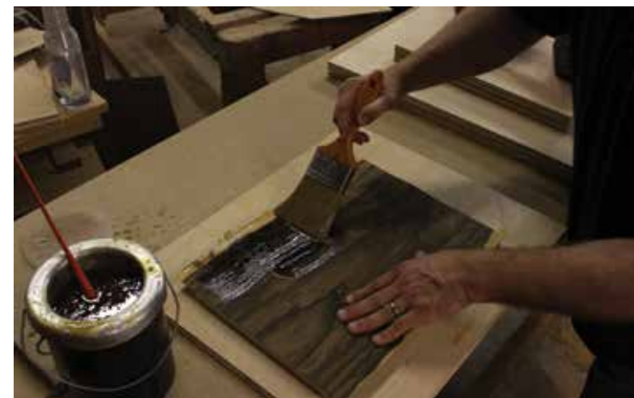
11 Brushing hot animal hide glue onto the face of the veneer

Nail the packet together by placing the four pieces with the paper face down and the template drawing face up. Place all five sheets on top of one plywood caul with a centre weight placed in the centre; this will keep the packet from moving. Start in the centre then nail outwards to the edges. Use a pair of needle nose pliers to hold the