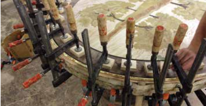
24 Strap clamping one at a time until all four wraps are glued to the top edge