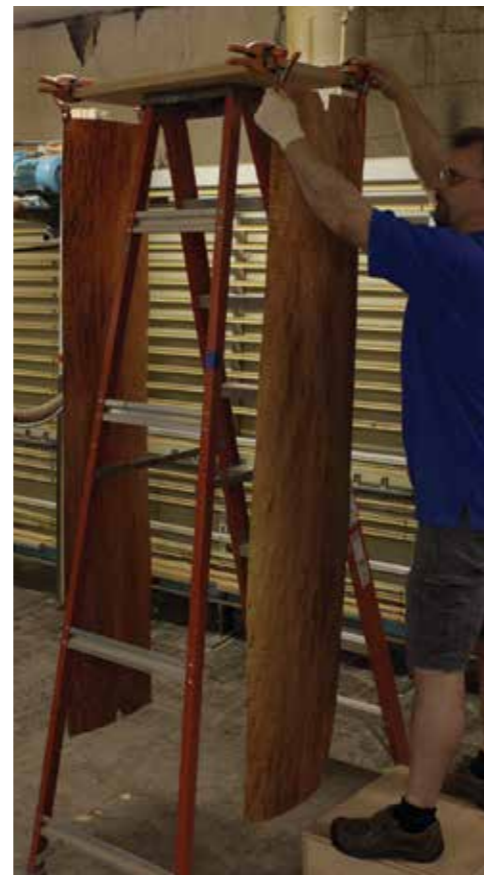
2 Hanging the veneer off the ground, from a ladder so it would dry evenly overnight