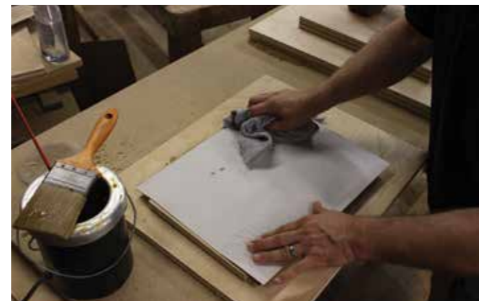
12 Flattening the veneer will prevent any chips or cracks while cutting on the scrollsaw

Take side-cutting pliers and snip off the pointed tips of each nail leaving just a tiny bit of the nail protruding. Use a hammer to tap the snipped nails flush with the bottom sheet of veneer; this will create a rivet that holds the veneer packet together.