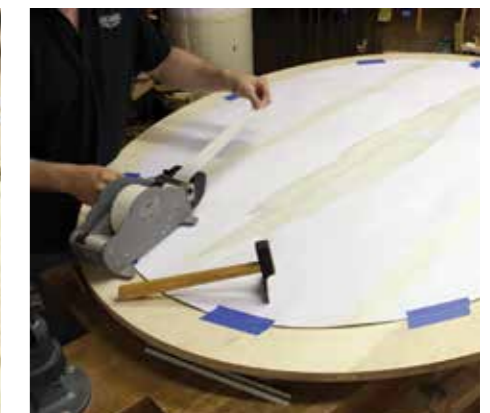
10 Flipping the entire piece of veneer over and applying the water gum tape