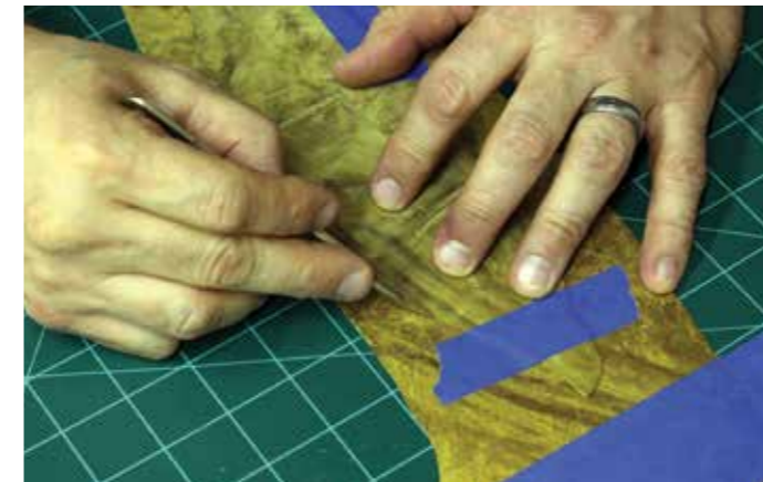
6 Cutting out a darker shade of green veneer that sits directly underneath the trees