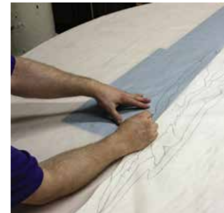
3 Using the 'window method' is a great way of drawing in the marquetry designs