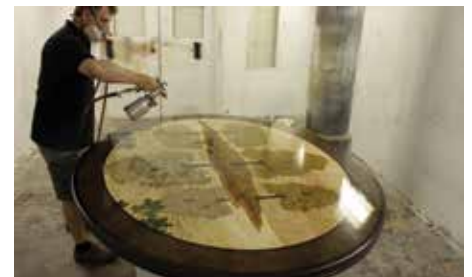
29 Spraying on the last coat before letting it sit overnight