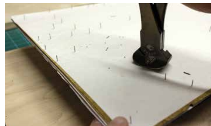
14 Take side cutting pliers and snip off the pointed tips of each nail, leaving just a tiny bit of nail protruding