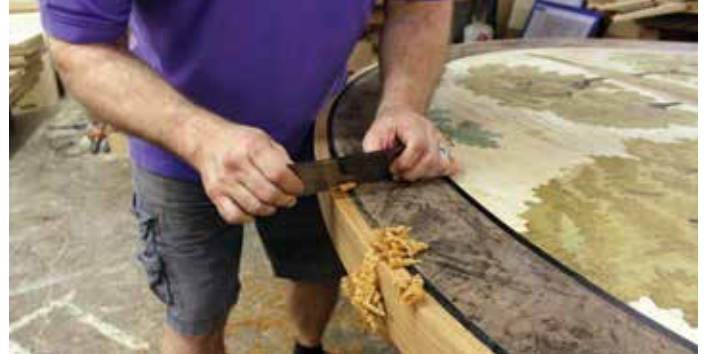
25 Cleaning up the top edges using a cabinet scraper