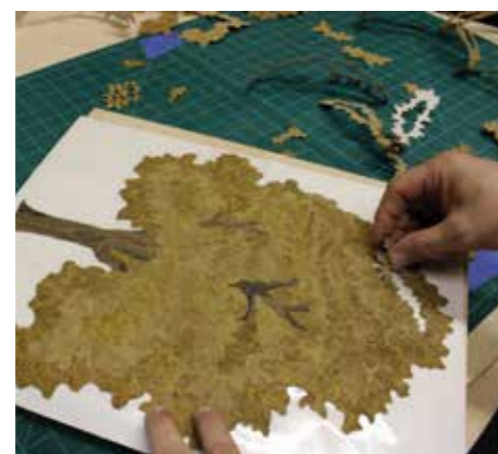
16 Using a scalpel to cut around the tree to remove the excess film paper