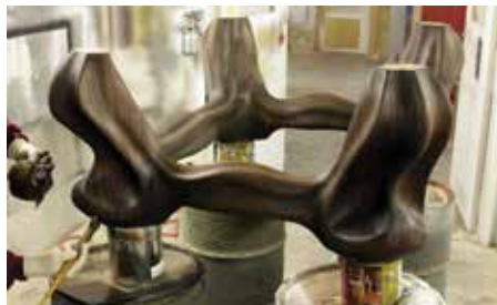
26 Brushing on the stain over the aniline dye

For the finishing of the top I use the same finishing steps as the legs, only I spray five coats, then wet sand with 320 grit to flatten the top. This step will remove approximately four dry coats of finish. I then add three more coats of finish sanding in between each coat with 320 grit abrasive. After I spray on the last coat, I don't sand and let it sit overnight before moving. The Art Nouveau coffee table is then complete. F&C