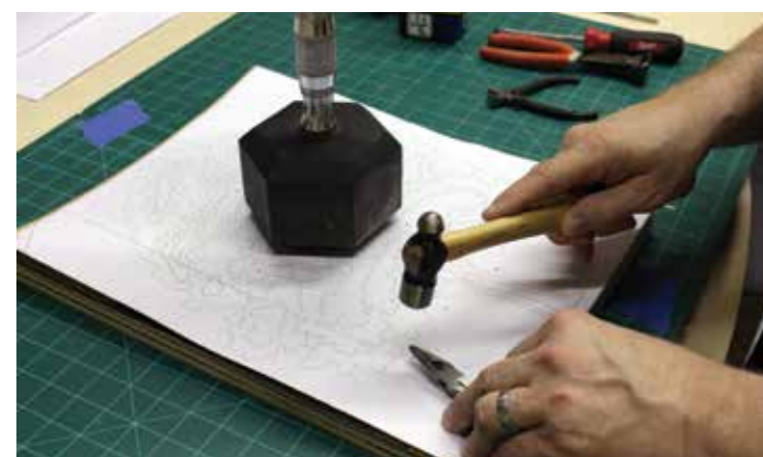
13 Use a pair of needle nose pliers to hold the small 12mm long 20-gauge nails in place