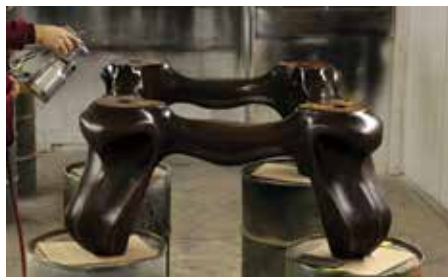
28 Spray three coats of satin pre-catalyzed lacquer over the entire base