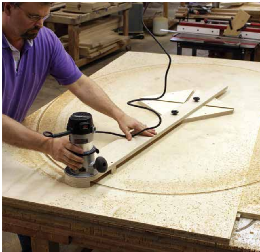
1 Cutting out the top of veneer core plywood

The window method is a technique that uses only a scalpel to cut the veneers. First, a template is used to draw a design onto the background veneer, then the template design is cut out from background veneer, creating a window. The window in the background veneer is then filled with another veneer, called the insert. Using the window method to cut marquetry takes a bit longer than other techniques, as there's a lot less preparation time involved. It's also a good marquetry method for cutting straight lines with a high degree of accuracy