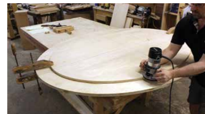
20 Using a router and a template guide with a 12mm diameter straight cutting router bit