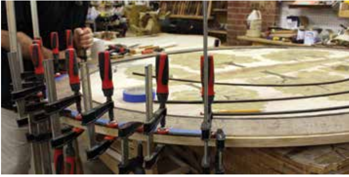
22 Bending three layers of 3mm around the clamping caul and outside edge of the top