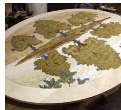
17 Once you have all the packets complete, place them on the background veneer and hold them in place with tape